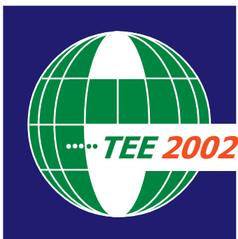
A UNITED ENGINEERING FOUNDATION CONFERENCE Davos, Switzerland 11-16 August 2002 http://www.coe.gatech.edu/eTEE